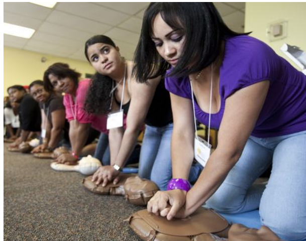
CHWs connect people with appropriate health and human services.